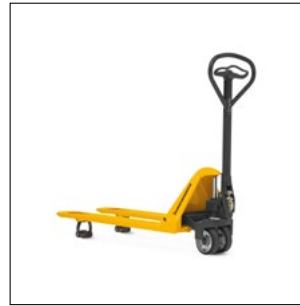
Permanently lubricated joints for maintenance-free operation