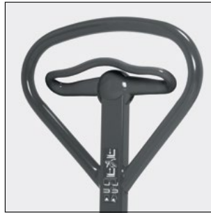
Ergonomic operating handle