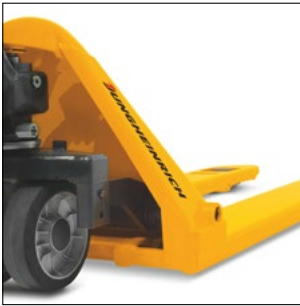
Low profile, sturdy forks