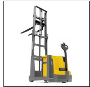
Excellent visibility through the mast