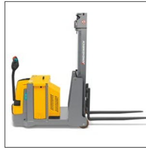
Sideways battery exit (optional)