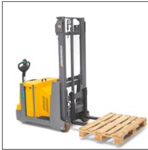
Lifting perimeter based pallets directly from the floor – no problem for the EJG